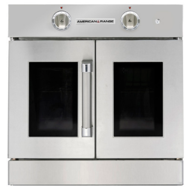
AROFG-30 SHOWN IN STAINLESS STEEL, AVAILABLE IN ANY RAL COLOR

See ralcolorchart.com for color options for the front panel & toe kick and/or knobs.