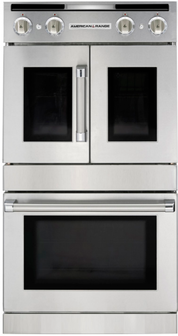
AROFSG-230 SHOWN IN STAINLESS STEEL AVAILABLE IN ANY RAL COLOR

See ralcolorchart.com for color options for the front panel & toe kick and/or knobs.