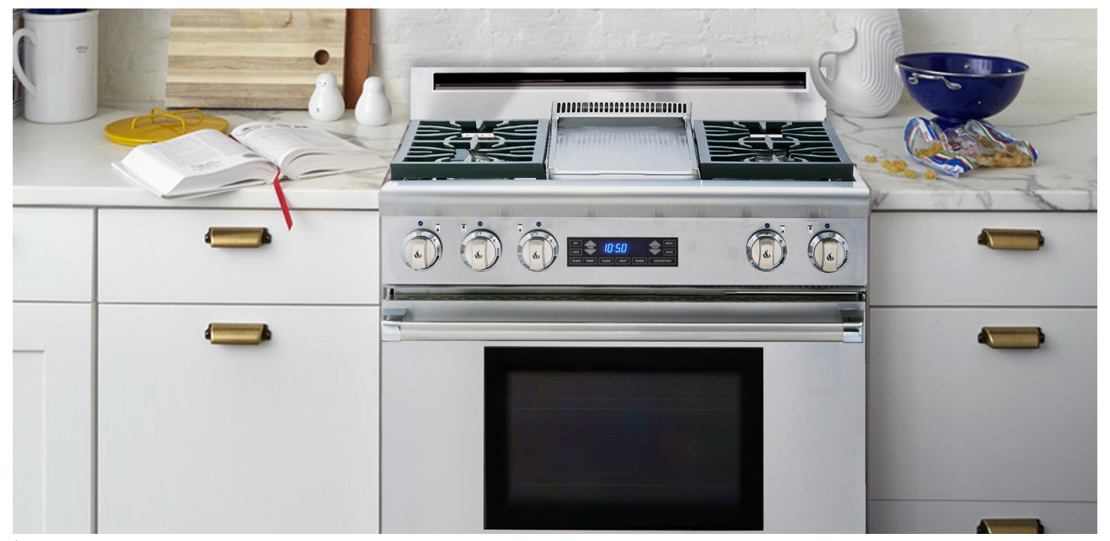
*ARR-364GDDF Shown with 4" Stub Back Hand polished stainless steel finish. Other models available