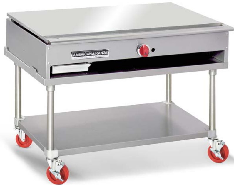
Model ARTY-48 Shown with optional stand & Casters.

American Range proudly presents the ARTY Teppan-Yaki Griddle. This design engineered commercial cooking product is perfect for the Japanese-style cuisine that traditionally uses an iron griddle to cook steak, shrimp, okonomiyaki, yakisoba, and monjayaki.