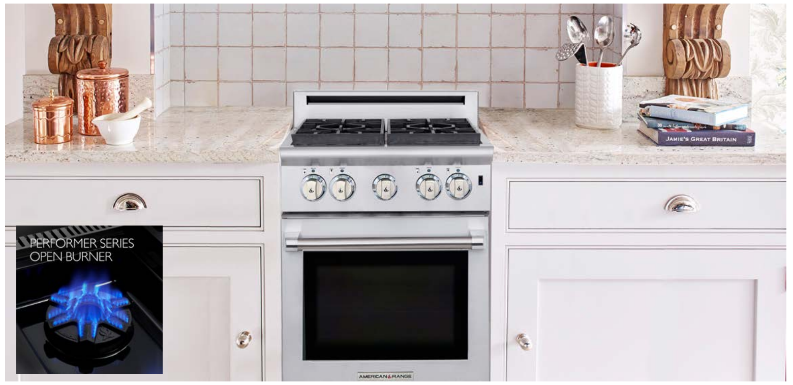
*ARROB-424 Shown with 4" Stub Back Hand polished stainless steel finish. Other models available